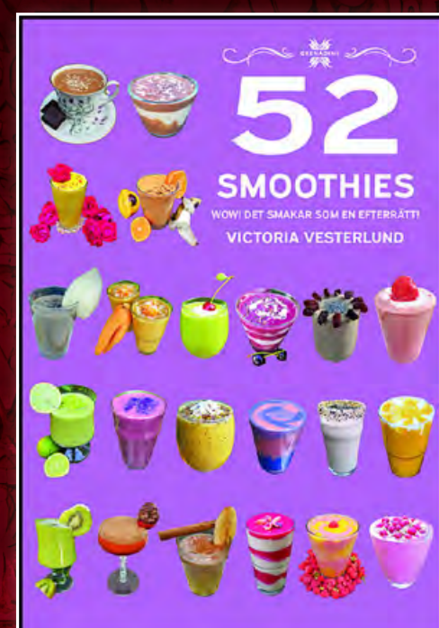
SWEDEN 52 SMOOTHIES VICTORIA VESTERLUND (GRENADINE)